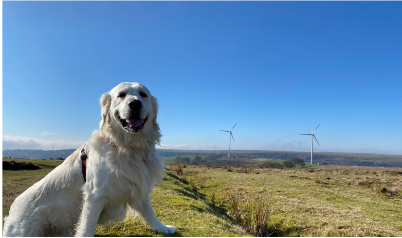
Cover Photo: "Wind Power", Manmoel Common.